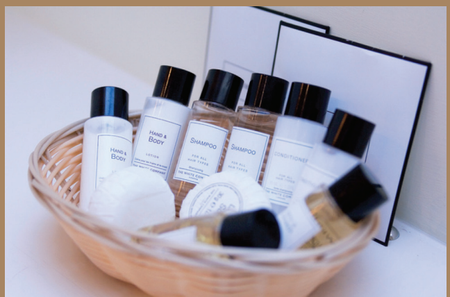
Luxury Toiletries in all rooms

Our guest accommodation is only a short stroll from the venue so why not enjoy an overnight stay with us and have a wonderful fresh breakfast the next morning. Our breakfasts include fresh farmhouse products and of course sausage and bacon rolls. We have twelve luxuriously appointed contemporary guest rooms including three family rooms and one fully accessible room which can sleep around 34 guests in total. We also have a recently renovated beautifully appointed self-contained garden cottage with sweeping views over the valley and lake. All of our accommodation of course has tea and coffee making facilities and luxury toiletries with our compliments.