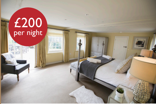
Garden Cottage Master Bedroom